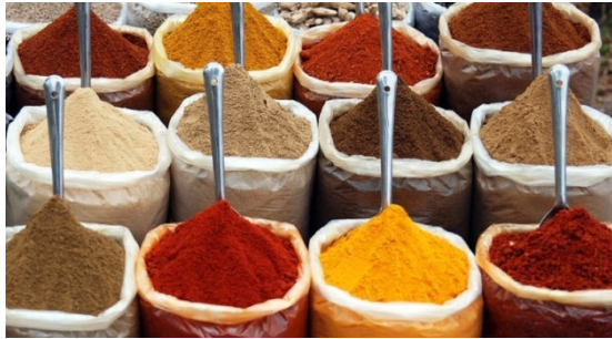
Photo: Appealing spices in vibrant colors at Anjuna flea market, Goa, India

Spices are the soul of food. One can judge food even before tasting it just by its mind triggering aroma and appearance. Apart from food, spices are also used in medicinal applications, perfumes and cosmetics.