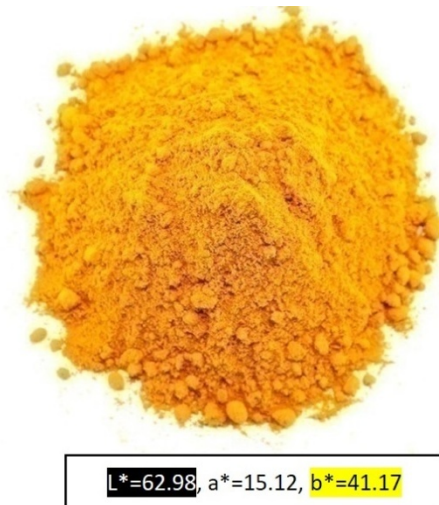
Sensegood Spectrophotometer for color measurement in turmeric

Sensegood spectrophotometer is very useful especially in maintaining color quality of mixtures of spices for masala manufacturers. Using Sensegood spectrophotometer, user can set desired sample as a reference and check match percentage value for production samples. If matching is poor; below set threshold, it provides audible alarm and display indication on LCD to alert operator. Hence operator can quickly react and take appropriate action to pass, reprocess or reject the sample. The information assists for the prompt corrective action which eventually leads to quick process parameters control, increase in the throughput and maximization of equipment usage. This surely results into low operational cost with improved product quality, consistency and market acceptability.