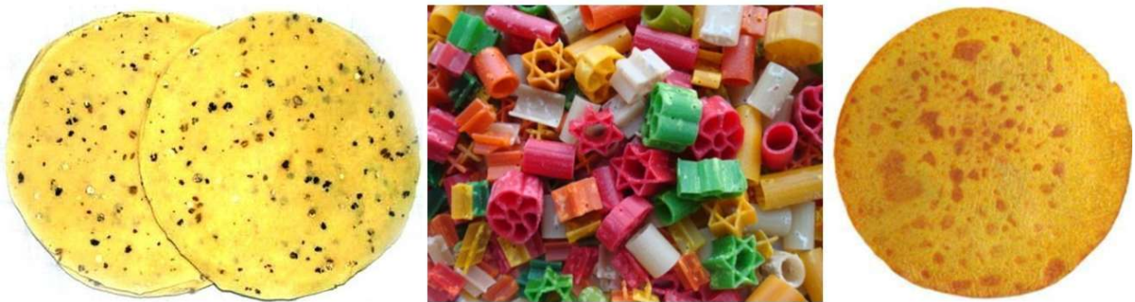
Photo: Papad products: from left – papad, fryums-papad pipes, khakhra

Papad or papadum is a thin crisp disc shaped food which can be consumed by roasting or even frying in oil. It is served along with the meal and also as a starter along with salads. In India, typical annual consumption of papad: 1-2Kg is consumed by 67% people while 3-4Kg is consumed by 24% people. There is also a cluster of people which accounts for 9% which consumes more than 5Kg of papads yearly. [1] This study was carried out for the papads which are made of black gram only. If other varieties of papads (Green gram papads, mathiya, etc) included then total yearly consumption number considerably increases. Apart from papads, there are other related products like khakhra, papad pipes and fryums in variety of shapes and sizes. Papad or its variants like nachos are consumed not only India but also in many other countries. To cater this continuous and largely growing market, manufacturers and suppliers need to meet consumer expectations in terms of quality.